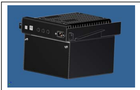
DC Replacement Module