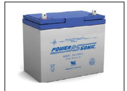
Single Battery 55 Ah, SLA