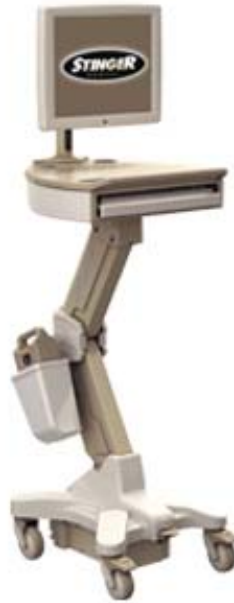
*shown with optional accessories