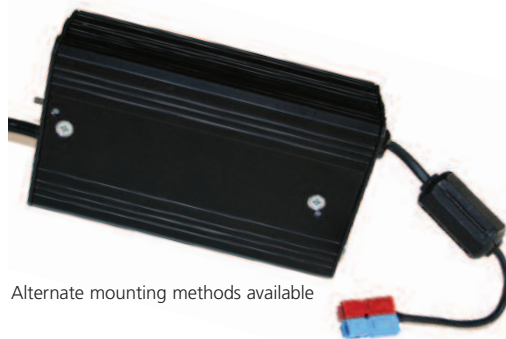
Alternate mounting methods available